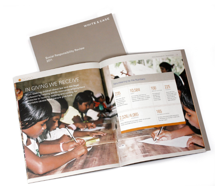
White & Case Social Responsibility Review 2011