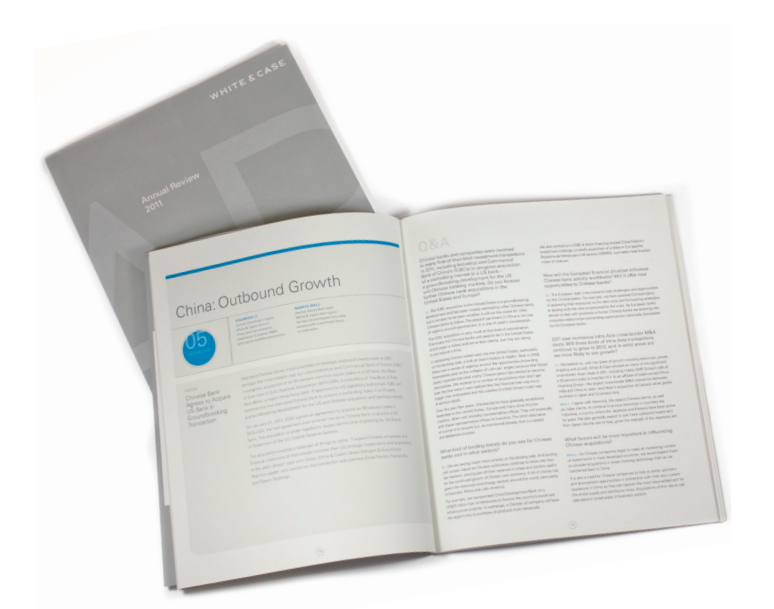
White & Case Annual Review 2011