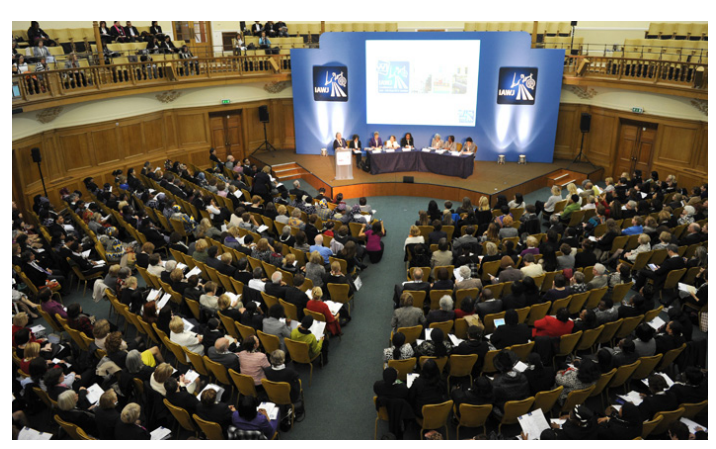
The International Association of Women Judges conference in London

The Right Honourable Kenneth Clarke, Lord Chancellor and Secretary of State for Justice; and The Right Honourable the Lord Phillips of Worth Matravers, President of the Supreme Court of the United Kingdom. Formed in 1991, the IAWJ is a nonprofit organization with more than 4,000 members at all judicial levels in 103 nations.