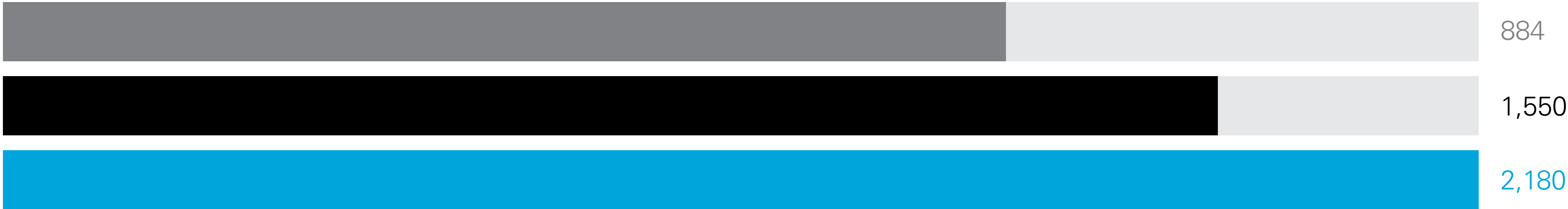
Number of cases filed in all jurisdictions other than the United States of America