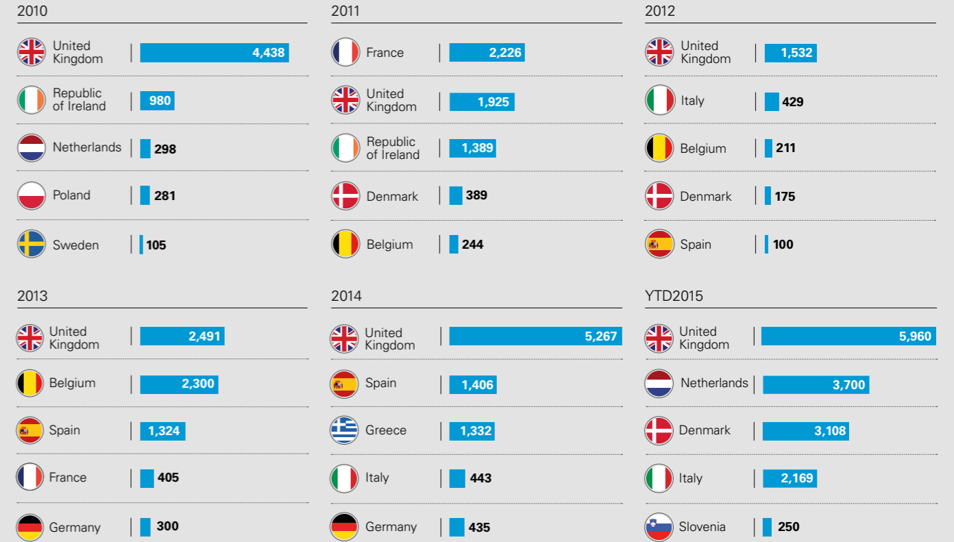
Private equity buyouts in European financial services sector: Top five countries by year, by deal count