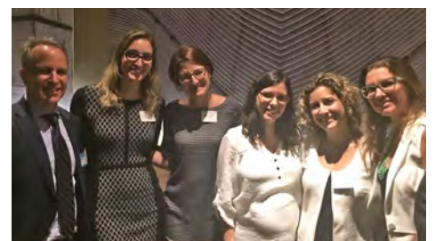
São Paulo, March 2016