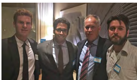
São Paulo, March 2016