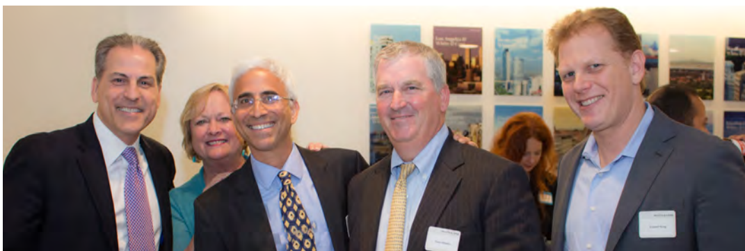
Miami, March 2016

Annual New York Alumni Reception 13 October 2016