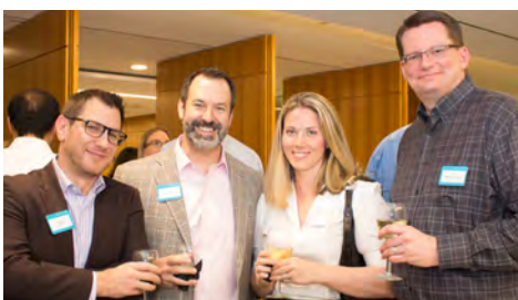
Miami, March 2016