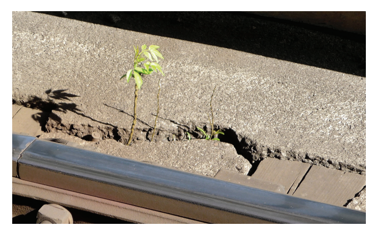
Americas - Heroic Plant by Holger Klaassen, New York

Lawyers and staff worldwide submitted photos they took to our Green Photo Contest. The finalists' photos were posted on our intranet and a Firmwide vote was held to select one winner from each region. More than 1,000 votes were cast. The winning photos are shown at right.