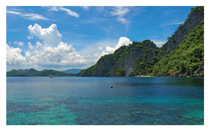
Asia - Crystal Clear Coron by Ramon Bejasa, Manila