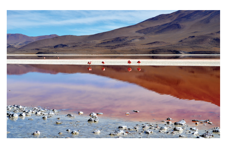
EMEA – Desertio Atacama by Adhuv Prinja, London